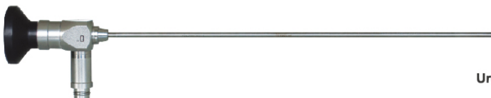
Urethra-cystoscope, arthroscope, hysteroscope, otoscope (without sheath)