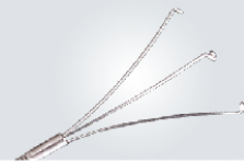
3-Prong Type Grasping Forceps