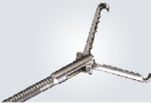
Pelican Jaws Type Grasping Forceps