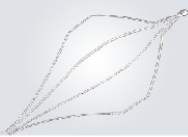
Fold Angular Basket Type Grasping Forceps