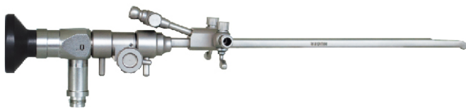
Urethra-cystoscope, arthroscope, hysteroscope, otoscope (with sheath)