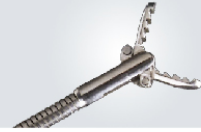
Alligator Jaws Type Grasping Forceps